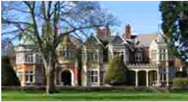
Bletchley Park Mansion

2012 is the year that the UK Slide Rule Circle is pleased to again host this regular annual event. For this meeting we have chosen Bletchley Park, home of the wartime codebreakers, as our main venue. Our main meeting will take place in the Library of the historic Victorian “Mansion”.