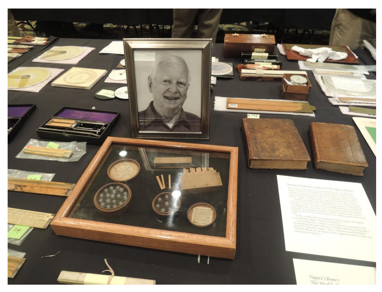
IM2015 - Some Rarities on Display from the Thomas Wyman Collection