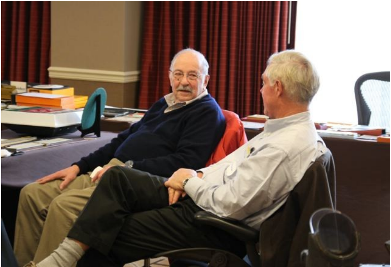
And here is auctioneer listening in. I have no idea what is so confusing!