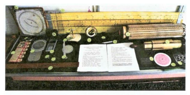
Clay's Display at Colusa County Library, California