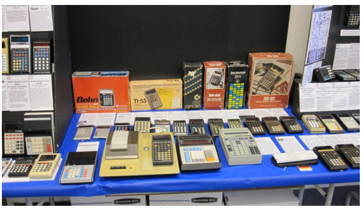
Figure 11. Examples of the Many Calculators in Mike's Display