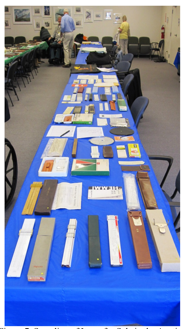
Figure 7. Sampling of Items for Sale in the Auction