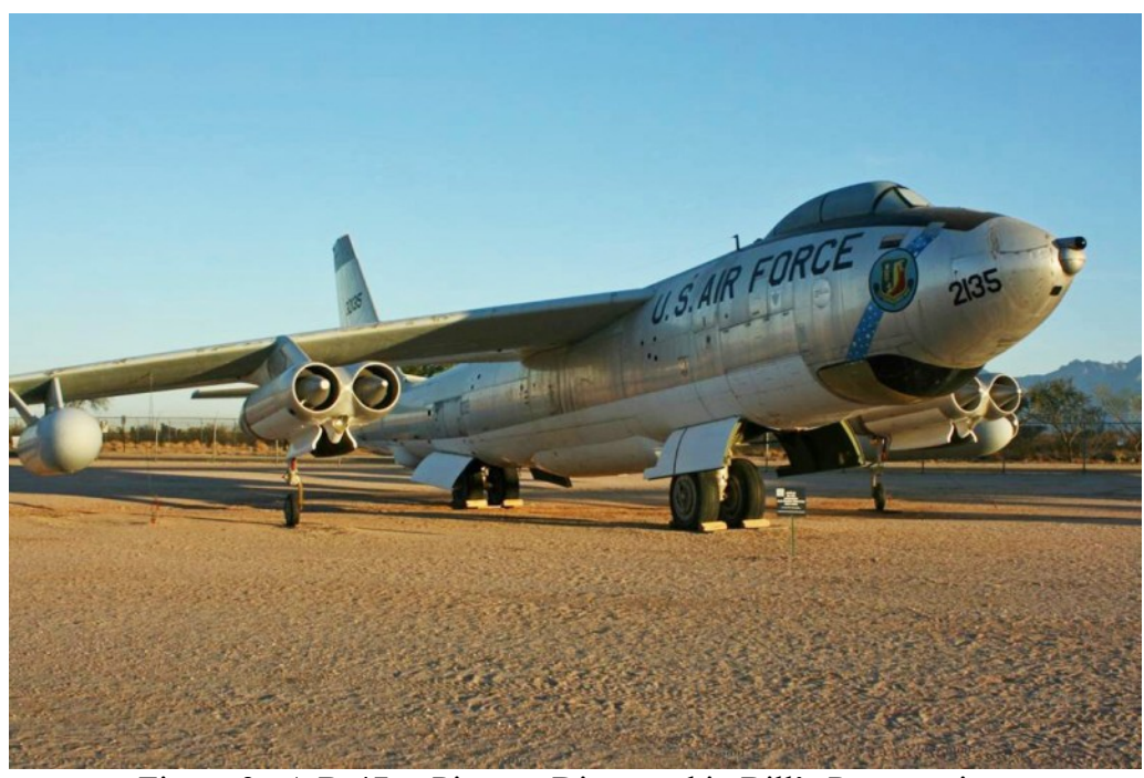
Figure 3. A B-47 at Pima as Discussed in Bill's Presentation

The B-52 is still flying today. Later we were able to see a B-47 and three B-52 bombers on display at the museum.