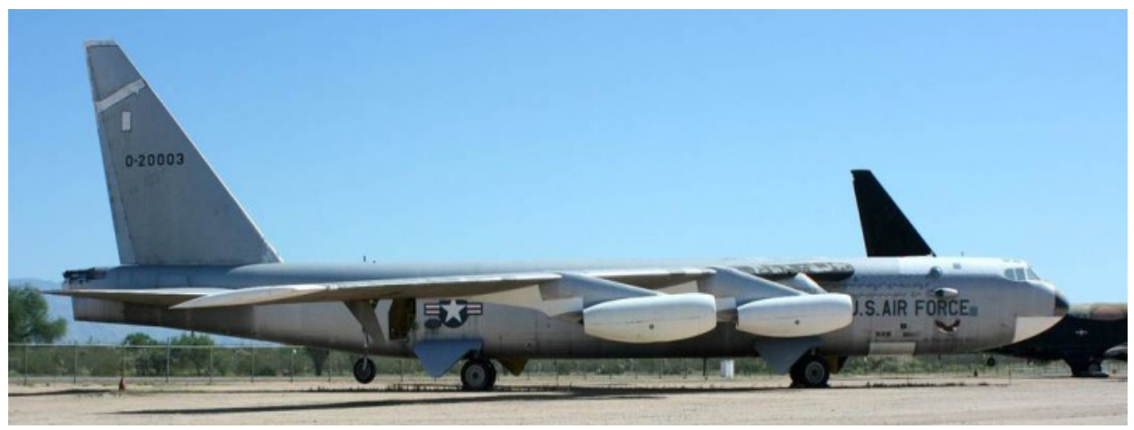
Figure 4. A B-52 at Pima as Discussed in Bill's Presentation

Following Bill's talk everyone inspected the tables with many unusual slide rules and displays. Dick Rose brought many rare slide rules for sale. Martha had several tables loaded with slide rules, calculating instruments, and drafting tools. Carl Schwent brought many NIB (New-In-Box) Pickett slide rules and a display of antique math teaching devices.