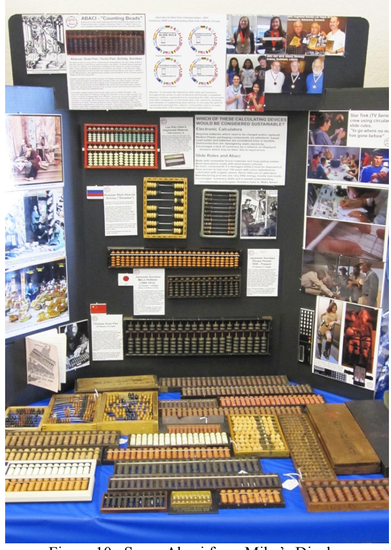
Figure 10. Some Abaci from Mike's Display