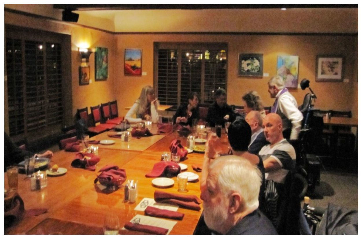
Figure 1. Dinner at the OldPueblo Grill

The 2013 Oughtred Society Winter Meeting convened at the Pima Air and Space Museum in Tucson, Arizona on Saturday, February 16. On Friday night we met in a private room at a fine gourmet Mexican restaurant called the Old Pueblo Grille and enjoyed some wonderful food and conversation.