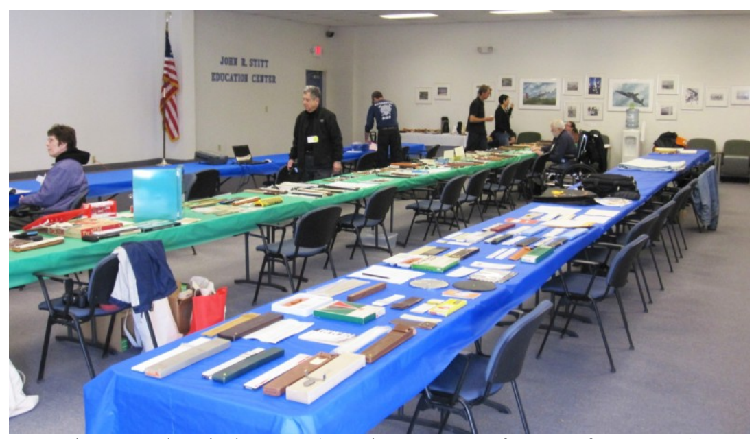
Figure 6. The Display Area (note the open space for ease of movement)