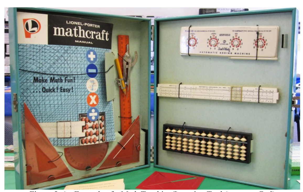
Figure 5. An Example of a Math Teaching/Learning Tool

Following Bill's talk everyone inspected the tables with many unusual slide rules and displays. Dick Rose brought many rare slide rules for sale. Martha had several tables loaded with slide rules, calculating instruments, and drafting tools. Carl Schwent brought many NIB (New-In-Box) Pickett slide rules and a display of antique math teaching devices.