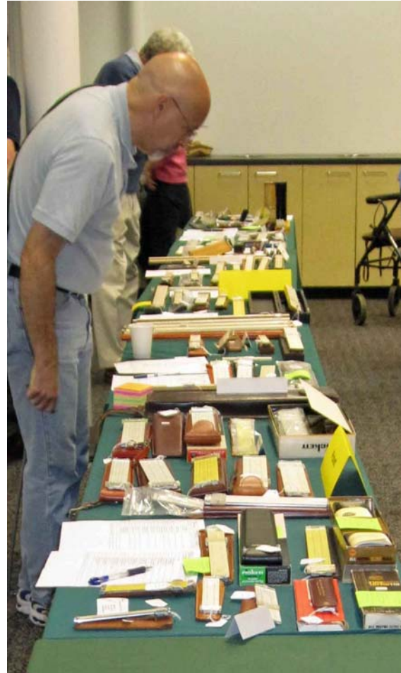
Slide Rule Inspection