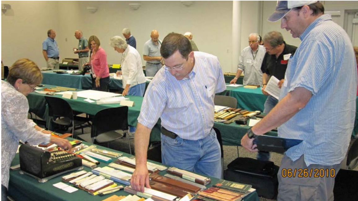
The Oughtred Society Bargain Table