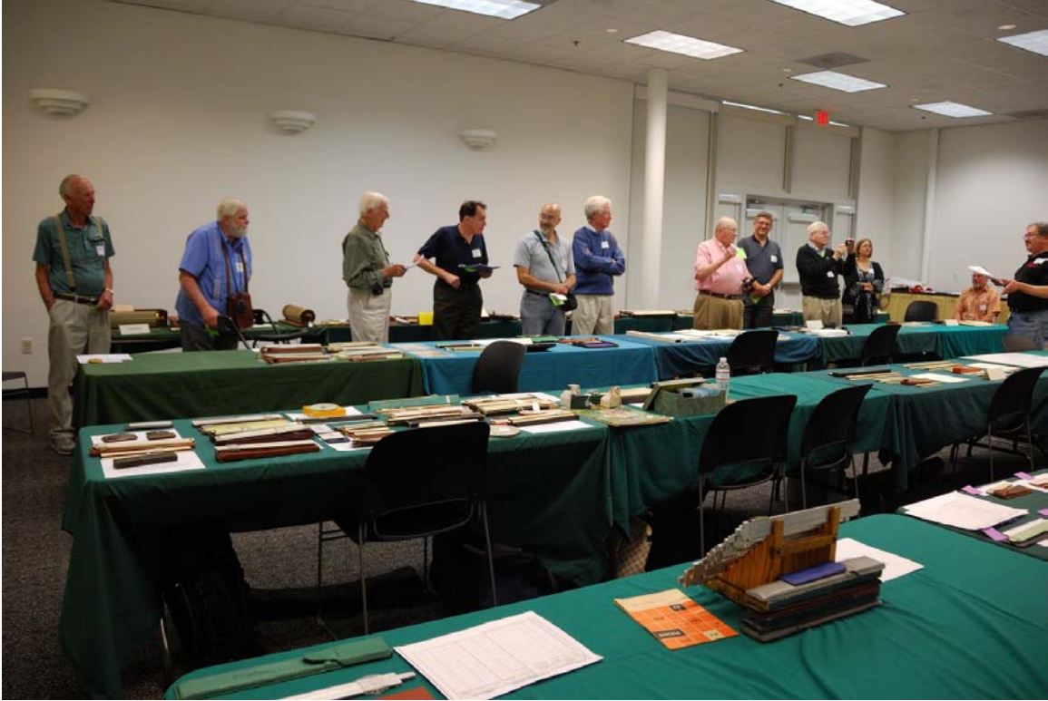
Auction in action