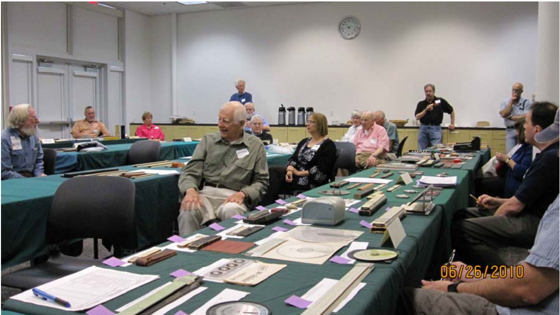
Clark's K&E Lecture